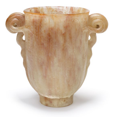
François Décorchemont (1880–1971) Grand bol deux anses serpents, 1923 Pâte de verre, Lost Wax Casting

Look for this work on level 4, in the gallery La nature , une source d'inspiration pour l'Art nouveau