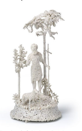
Figurine de Saint Jean-Baptiste, 18th Century Lampwork Glass Donation from the Endowment Fund of Doctor and Madame Léon Crivain, 2023

Look for this work on level 3, in the gallery Le vocabulaire architectural 1600-1700